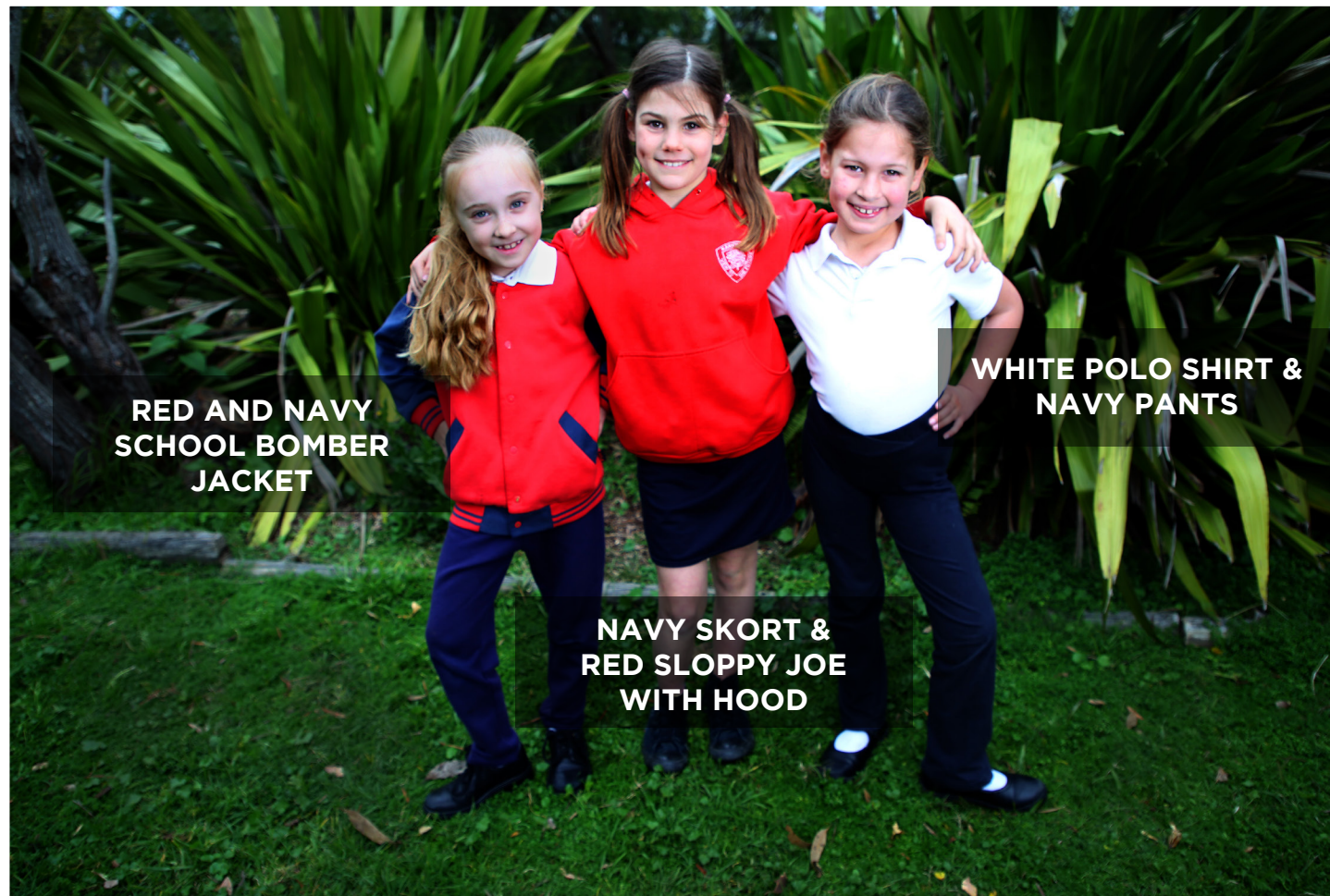
RED AND NAVY SCHOOL BOMBER JACKET