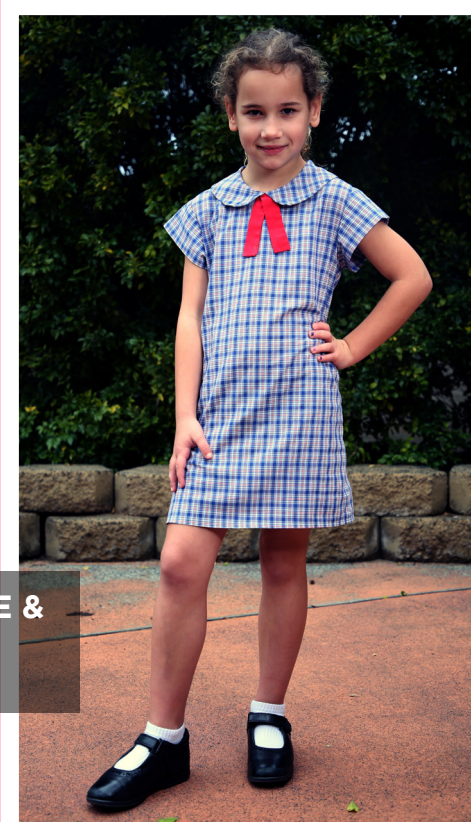
A-LINE RED, WHITE & BLUE CHECKED DRESS