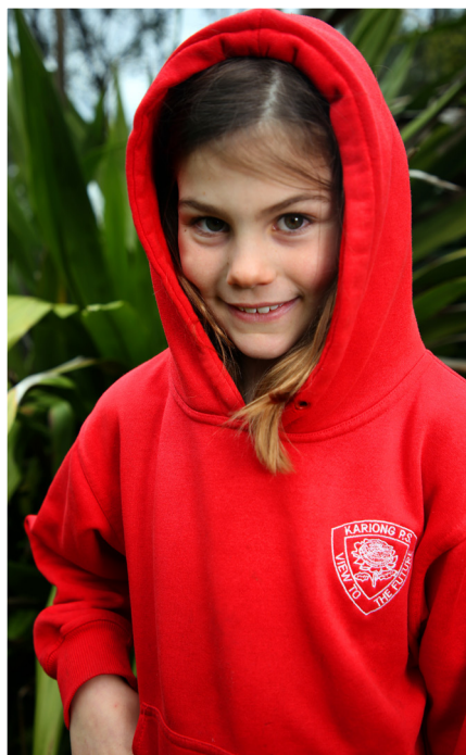
NAVY SKORT & RED SLOPPY JOE WITH HOOD