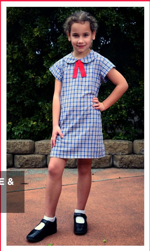
A-LINE RED, WHITE & BLUE CHECKED DRESS