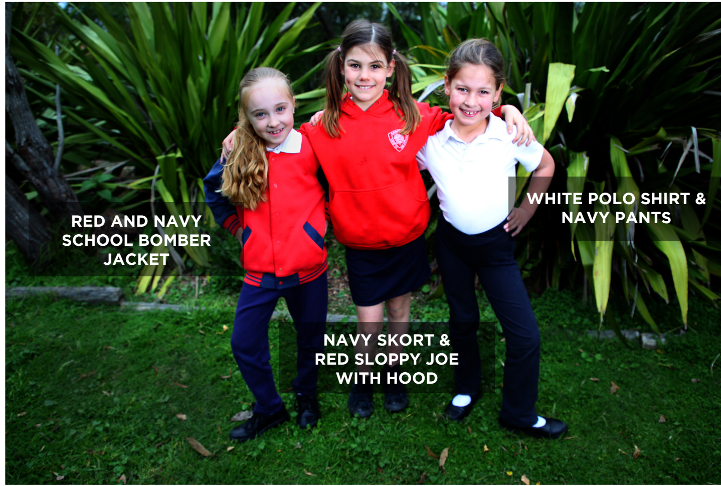
RED AND NAVY SCHOOL BOMBER JACKET