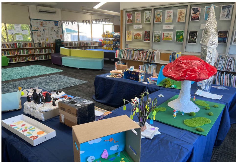
ABOVE: 'Read, Grow and Inspire' building creations for Book Week 2023