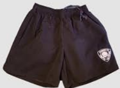
NAVY SPORTS SHORT $25.00