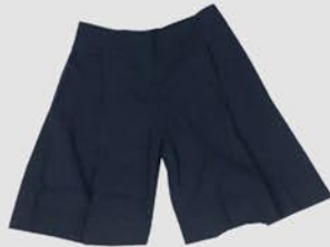
NAVY CULLOTTES $25.00