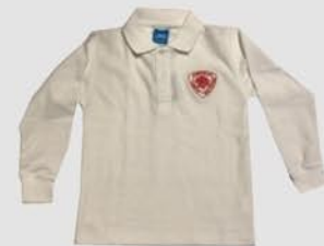
LONG SLEEVE POLO $25.00