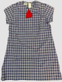
SUMMER TUNIC $42.00