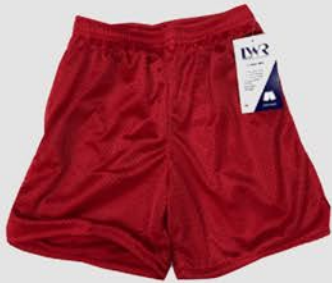
RED BASKETBALL SHORTS $15.00