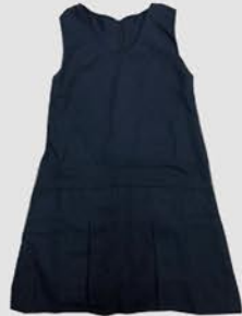
WINTER TUNIC $50.00