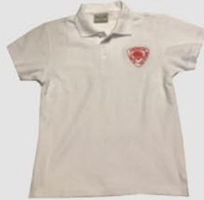
SHORT SLEEVE POLO $25.00