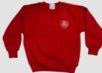
ROUND NECK SLOPPY JOE $27.00