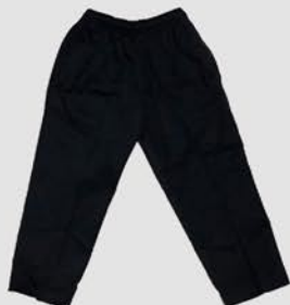
BOOTLEG TRACKPANT $25.00