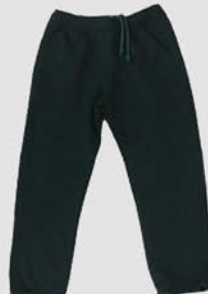
E/L TRACKPANT $22.00