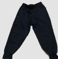
CUFF DOUBLE KNEE T/PANT $27.00