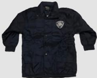
JACKET WATERPROOF $50.00