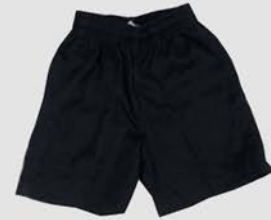
GAB NAVY SHORTS $22.00