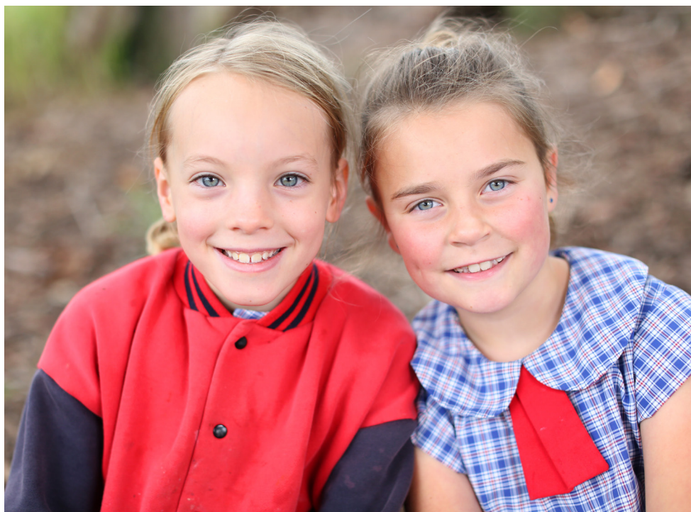
ABOVE: See our "School's out" gallery inside.