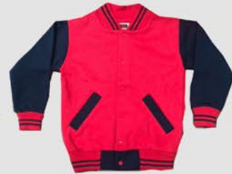
JACKET BOMBER $45.00