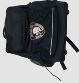
MIGHTY TUFF BACKPACK

Why not try on and go home and do an online order when it suits you.