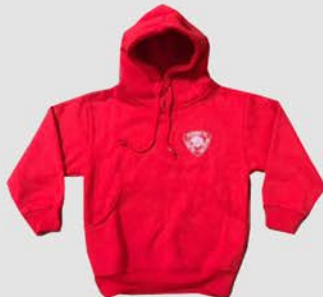
RED HOODED $35.00