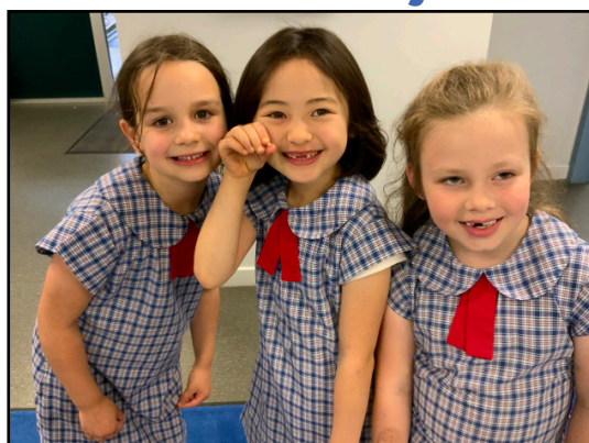
When students come to the office window with holding a tooth, they are given a little bag to put it in to take home.