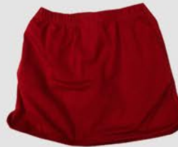
RED SKORTS $18.00