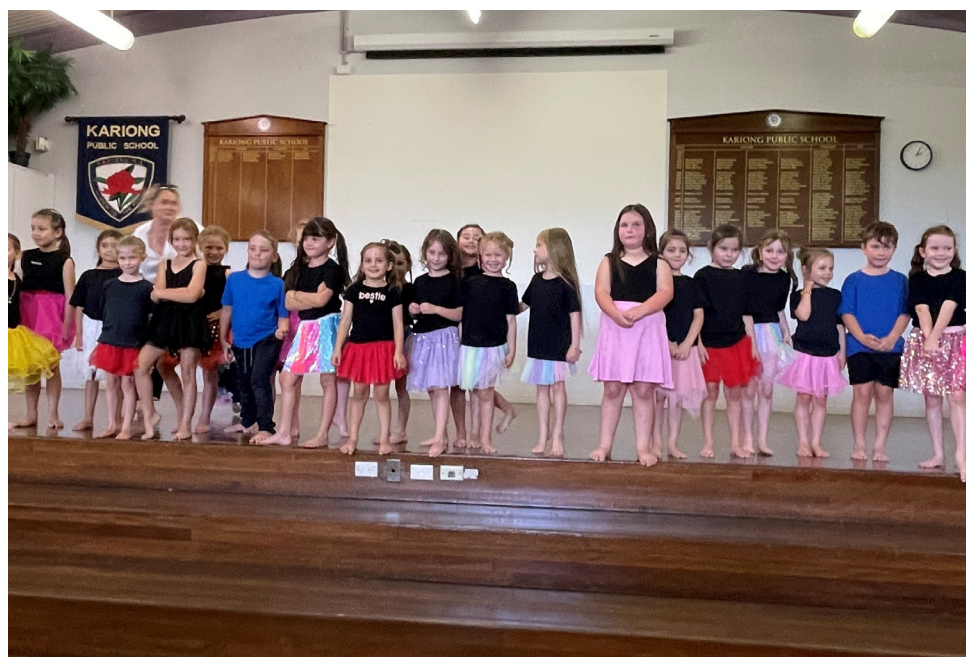
ABOVE: a snapshot of Early Stage 1 dance group. More photos to come of Grandparents in next weeks newsletter.