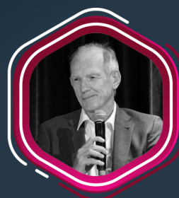
Wayne Bennett Professional Rugby League Coach