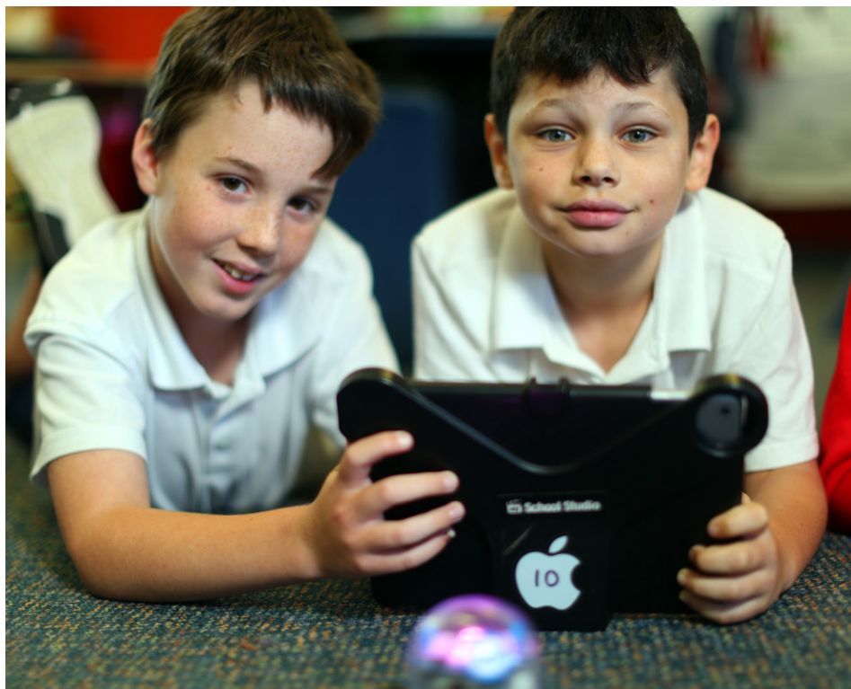
ABOVE: Coding with the Spheros in the STEM room. Gallery on Page 4.