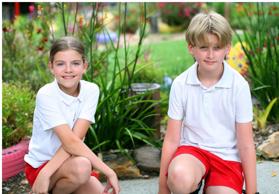
ABOVE: It was so nice returning to school this week and seeing how much our garden (and some of our friends) have grown!