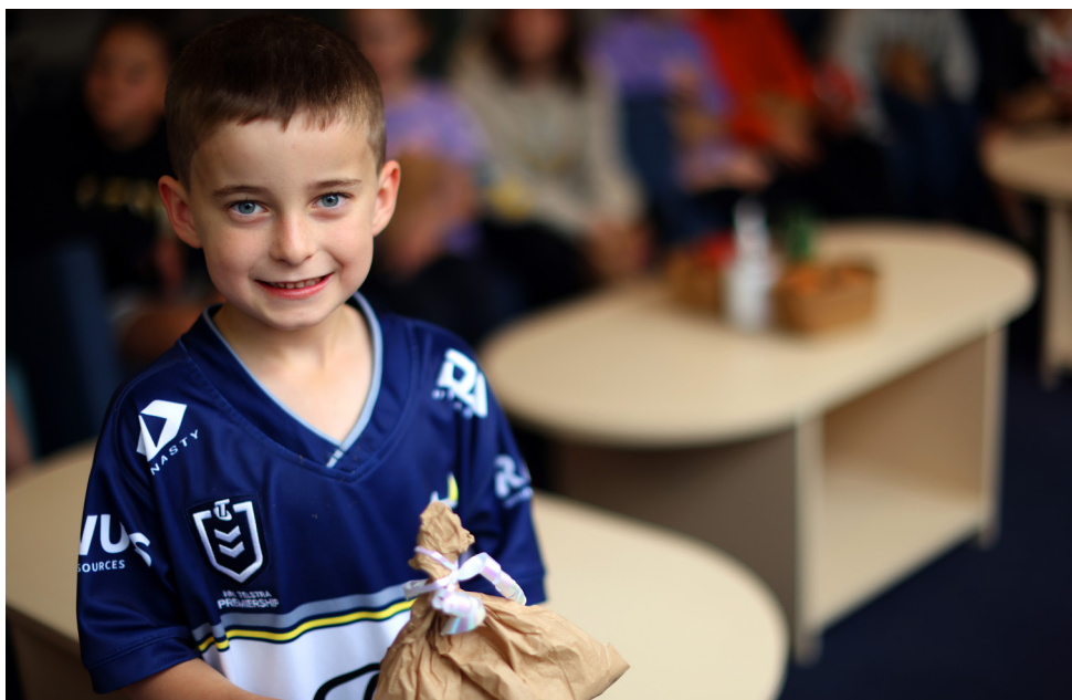
ABOVE: Aussie of the Month. Full gallery inside.