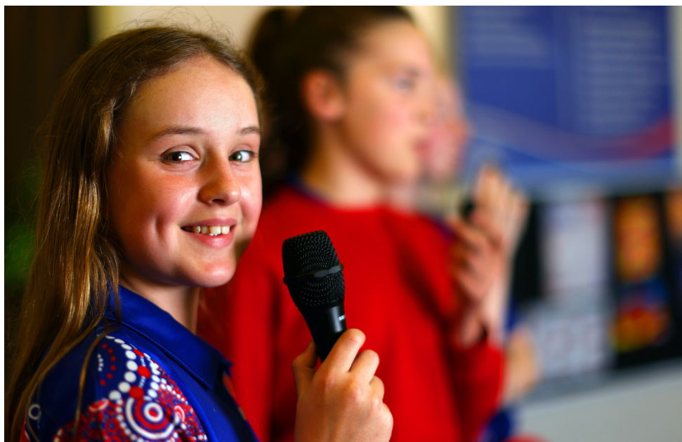
ABOVE: Year 6 performing in the hall at lunchtime. Full gallery inside.