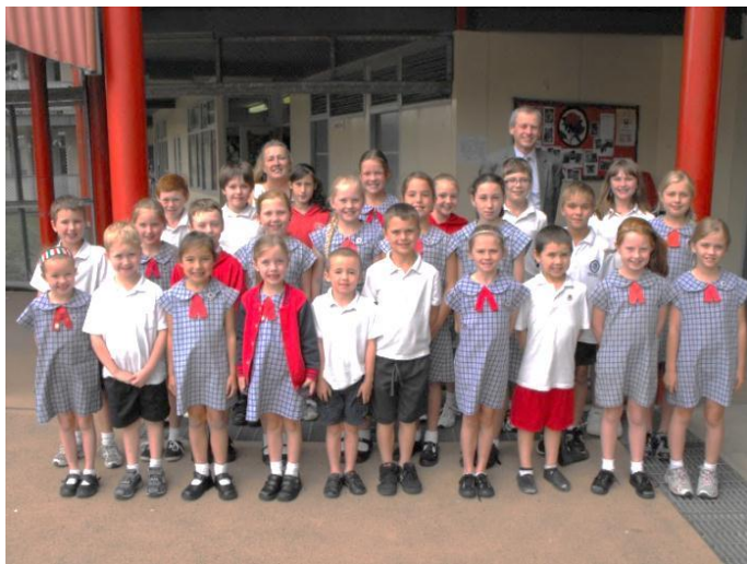
Our Value Of The Month for November recipients – Integrity -