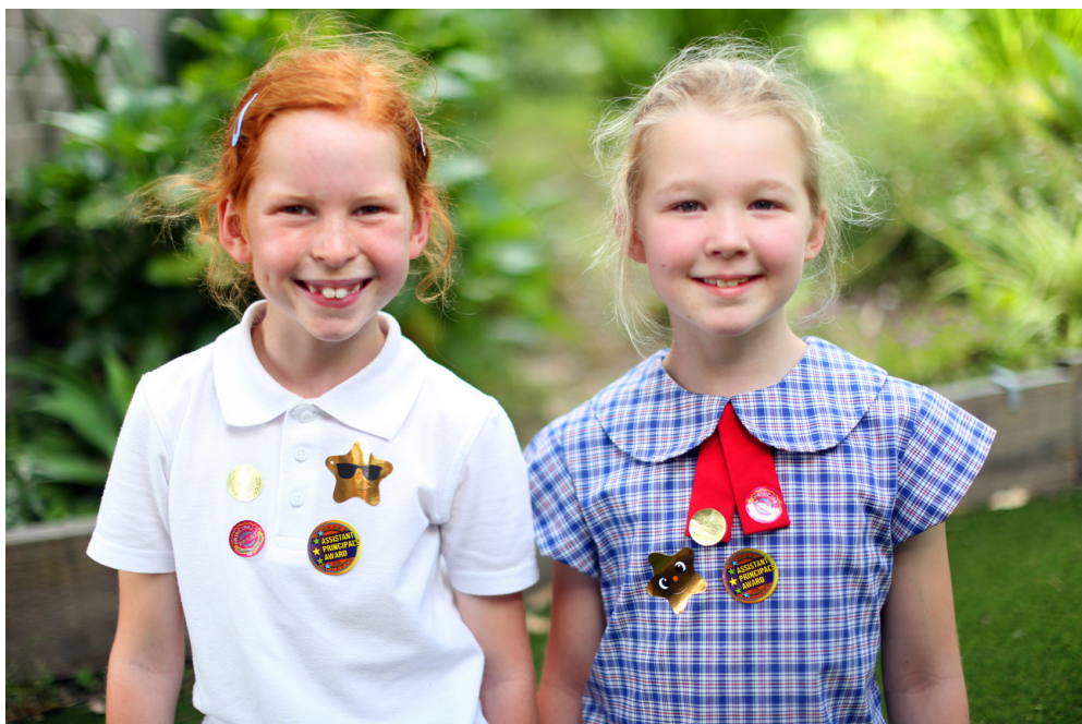
ABOVE: Two students in Year 2 wrote and published their own book. Full report inside.