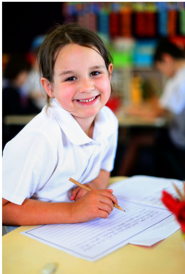
BACK PAGE: Year 1 gallery.

Some reward winners for doing their personal best below.