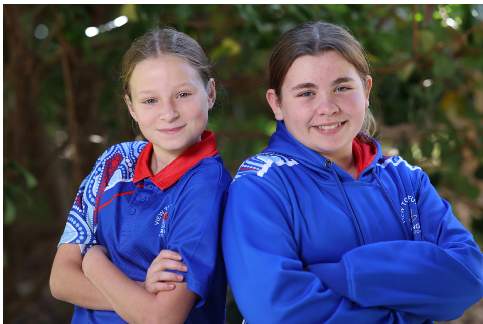
ABOVE: See our incredible brand new Year 6 hoodie and T-Shirts.