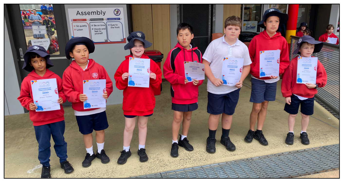
ABOVE: Our Tournament of the Minds winners. What a team!