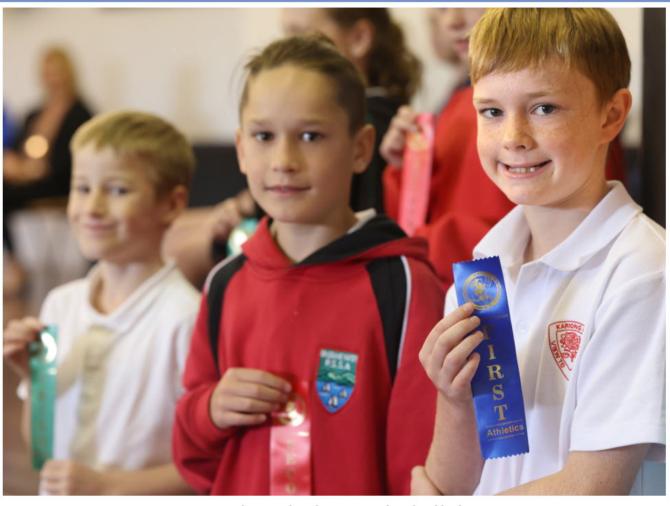
ABOVE: Our Sports Awards took place in the hall this morning.

Year 1 Excursion - Excursion Rouse Hill House and Farm