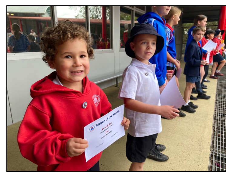
ABOVE: Value of the Month. Congratulations.