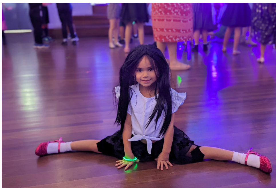
ABOVE: See photos from our amazing disco in this issue.