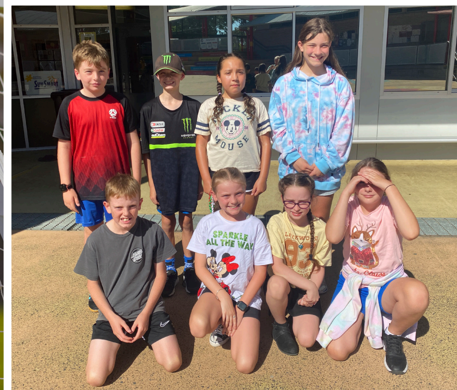
ABOVE: Our 2024 Sports Captains.

Our 2023 sports boy swam well at the KPS swimming carnival, going through to zone. He came 4th in the school cross country, representing at zone also. This boy also went through to the zone athletics carnival and made it through to the zone soccer team. He made the school soccer, rugby league, touch football, OzTag, Futsal and basketball teams. Very high involvement and effort in getting in as many teams as possible. I know personally this has been a goal of his all year to achieve this, and it's cool to see it pay off for him.