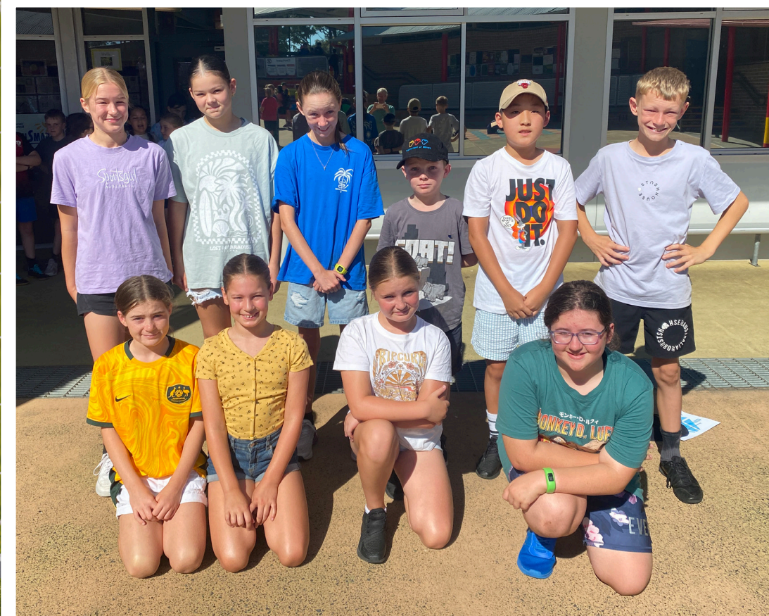
ABOVE: Our 2024 Sports Leadership Team.