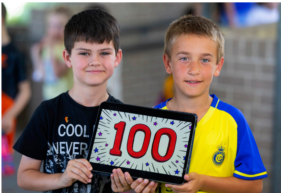
ABOVE: Wow. Our newsletter marks 100 issues this week.

Last day students 1pm Kariong Mountains HS Music Tour