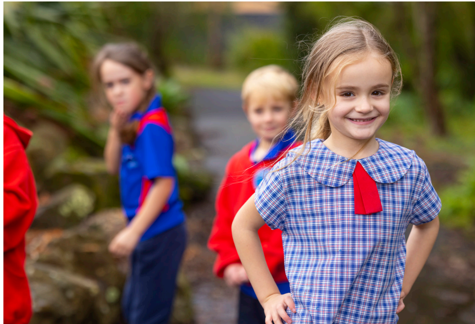
ABOVE: Kindergarten have achieved another milestone: their first semester completed.