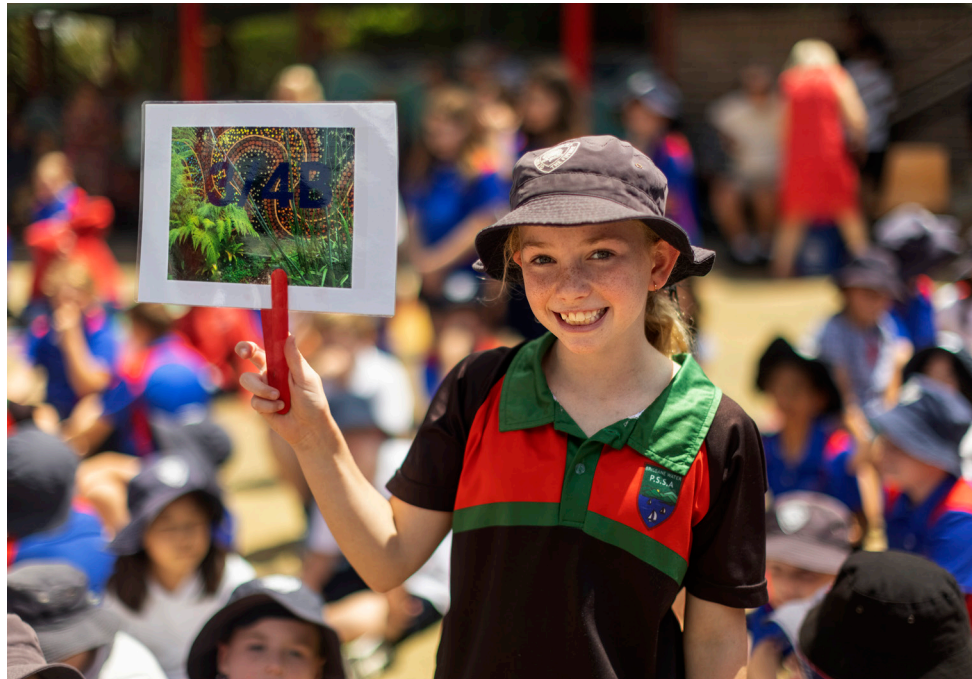
ABOVE: Grandparents' Day was today at Kariong Public School.

Year 6 Mini Fete 3-6 Assembly in the Hall