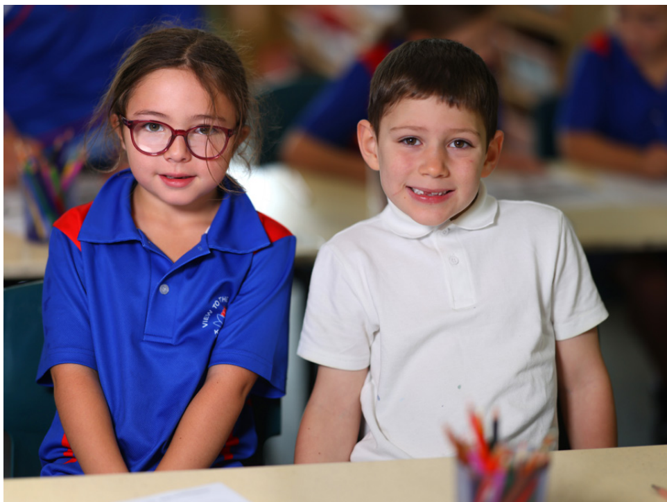
ABOVE: Today's newsletter is featuring our wonderful Year 1 students.