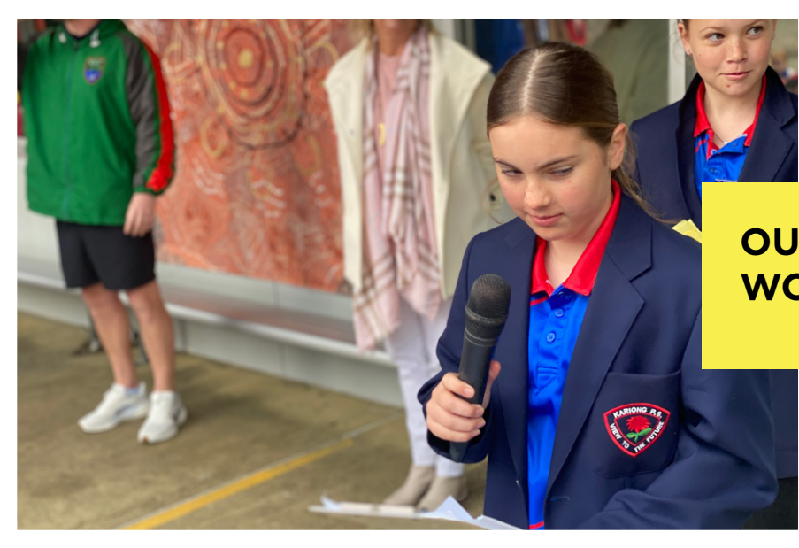
OUR STUDENT LEADERS AT WORK.