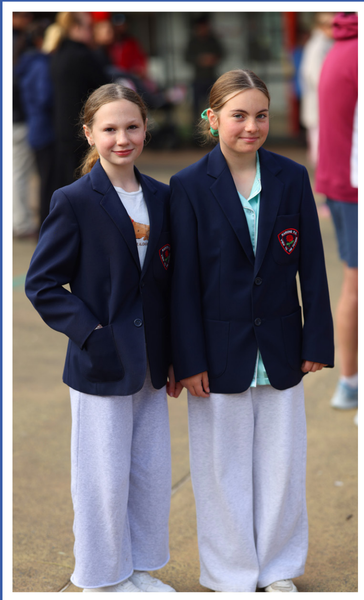
OUR STUDENT LEADERS AT WORK.